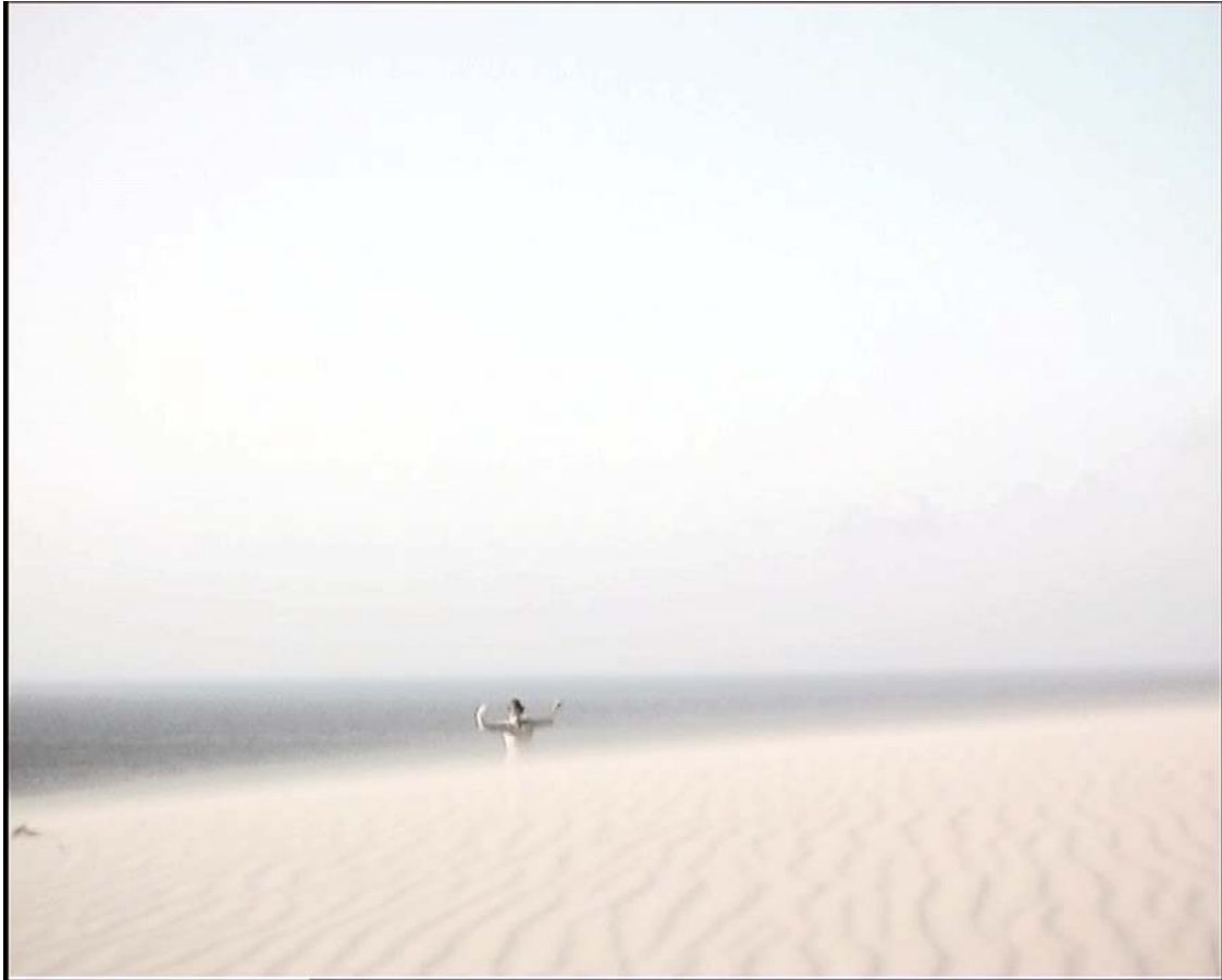
Vanishing Point by Rosemary Butcher

critical response, even though it is also the case that in each new instance, it is required to be 'new'. Thus signature practice is not simply singular, but – apparently paradoxically – it is recognisably so, and coherent with the discipline, hinting at the presence of performance 'regularities', across the body of her work. It is apparently challenging, but at the same time its production values are professional, hence more or less stable in terms of, or referencing the terms specific to external evaluation; and its 'newness', when it emerges, excites rarely consistent expert commentary.